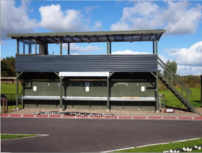
Drivers Stand: 10 drivers