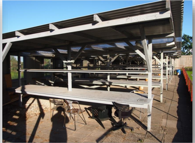
Paddock: 80 - 100 drivers